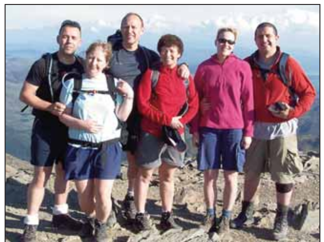
● PEAK FITNESS: This intrepid team from D Division raised over £4,000 for various charities after climbing Britain's three highest peaks

"I think by the end of the walk everybody realised they had achieved something special."